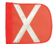
FLAG11-O-X Orange with White Reflective "X" 11.5" L x 11.5" H