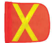
FLAG11-O-XY Orange with Yellow Reflective "X" 11.5" L x 11.5" H