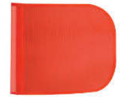
FLAG11-O Orange 11.5" L x 11.5" H

Mesh Flags, Fluorescent Safety Colors, UV Resistant, Anti-Microbial & Fray Resistant