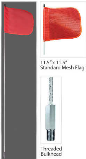
11.5" x 11.5" Standard Mesh Flag

Super affordable and lightweight warning whips for all Light Duty vehicle & equipment needs. Every whip is constructed with safe & non-conductive Fiberglass with standard whip lengths from 2ft (.61m) up to 7ft (2.13m). Customizable lengths are also available upon request. Complete your whip solutions with our various assortment of safety flag and mounting options for all equipment and vehicle needs!