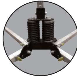
Heavy Duty Double Spring