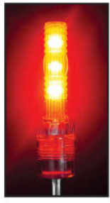
SC4-CR Red LEDs