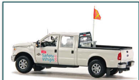
UPMT mounted with a powered 13ft (3.96m) Telescoping Whip (TW13D-X) with 16" Reflective "X" flag and SC4 series Red LED whip light. Mounted on truck toolbox.