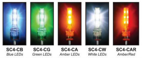
SC4-CB Blue LEDs SC4-CG Green LEDs SC4-CA Amber LEDs SC4-CW White LEDs SC4-CAR Amber/Red